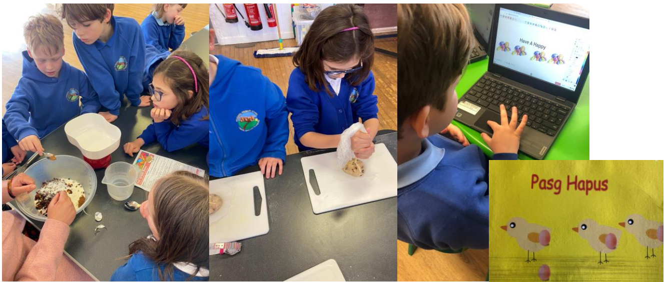
Bae dau have enjoyed making their own hot cross buns this week. They have used they're DCF skills to make Easter cards. The children listened to the Easter story which inspired them to create some pebble art.